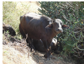
Tags: india Labels: cow