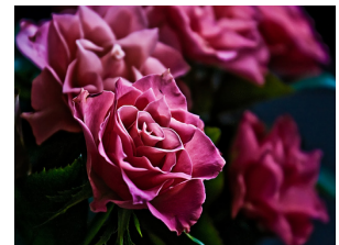
Tags: rose, pink Labels: flower, plant life