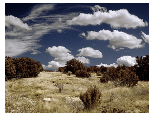
Tags: desert,nature,landscape,sky Labels: clouds, plant life, sky, tree

The goal of image classification is to decide whether an image belongs to a certain category or not. Different types of categories have been considered in the literature, e.g. defined by presence of certain objects, such as cars or bicycles [7], or defined in terms of scene types, such as city, coast, mountain, etc. [12]. To solve this problem, a binary classifier can be learned from a collection of images manually labeled to belong to the category or not. Increasing the quantity and diversity of hand-labeled images improves