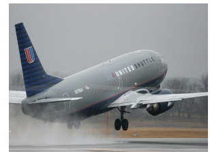
Tags: aviation, airplane, airport Labels: aeroplane