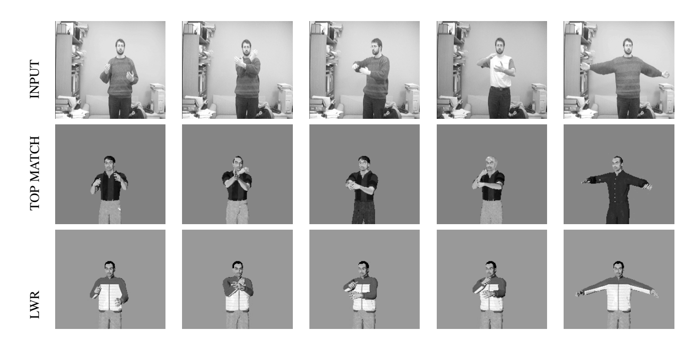
Figure 4. Examples of upper body pose estimation (Section 4). Top row: input images. Middle row: top PSH match. Bottom row: robust constant LWR estimate based on 12 NN. Note that the images in the bottom row are not in the training database - these are rendered only to illustrate the pose estimate obtained by LWR.