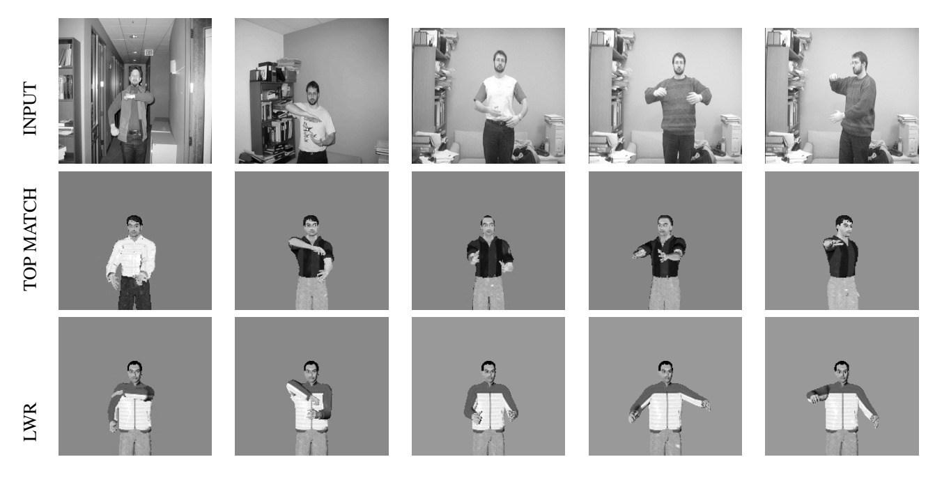
Figure 5. More examples, including typical "errors". In the leftmost column, the gross error in the top match is corrected by LWR. The rightmost two columns show various degrees of error in estimation.